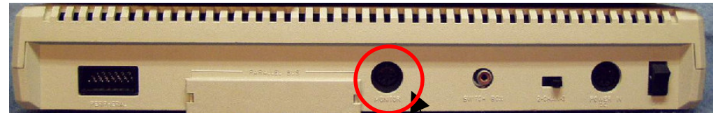
Atari 800XL Video/Audio Port

Note 1: I do not have a picture of the Atari 1200XL. Connect the DIN (black) plug to the "Monitor Output" port. Note 2: The audio signal is still monophonic because the computer does not generate stereophonic sound