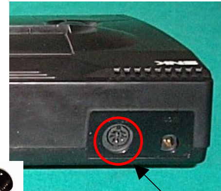
Neo Geo Video Port

Note 2: The picture shows the SNK Neo Geo. Look for a similar plug in your Neo Geo console