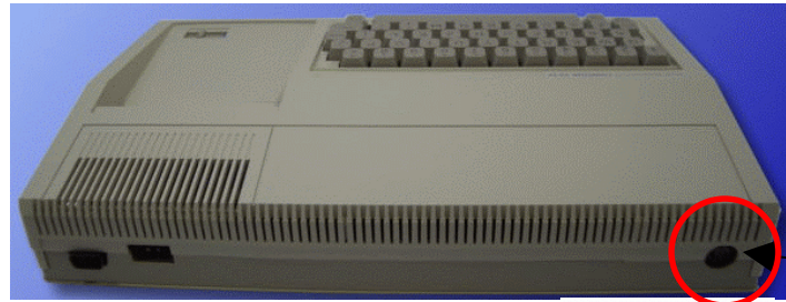
TI 99/4a Video/Audio Port